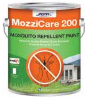
MozziCare 200: Premium mosquito-repellent exterior grade acrylic emulsion, available in matt smooth finish