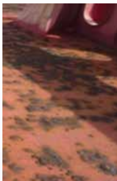
Scattered corrosion to Main deck of FPSO