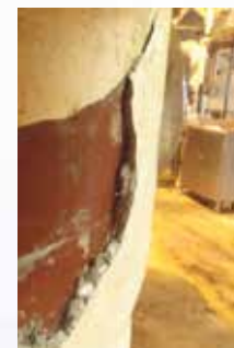
Corrosion under passive fire protection system (CUF)