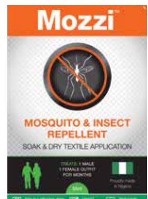
Mozzi™ Soak & Dry Clothing Application: 1 application = 1 month protection against mosquitoes and biting insects