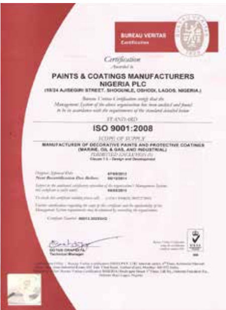
World Class HSE