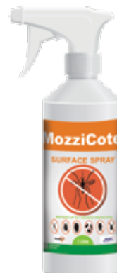
Mozzi™ Surface Spray: Internal and external surface applications (for walls, ceilings, door entrances) for up to 3 months protection