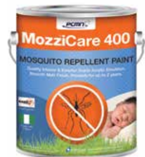
MozziCare 400: Economy grade interior and exterior mosquito-repellent emulsion, available in smooth matt finish