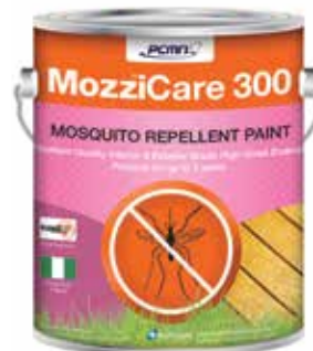
MozziCare 300: Premium interior and exterior mosquito-repellent enamel gloss