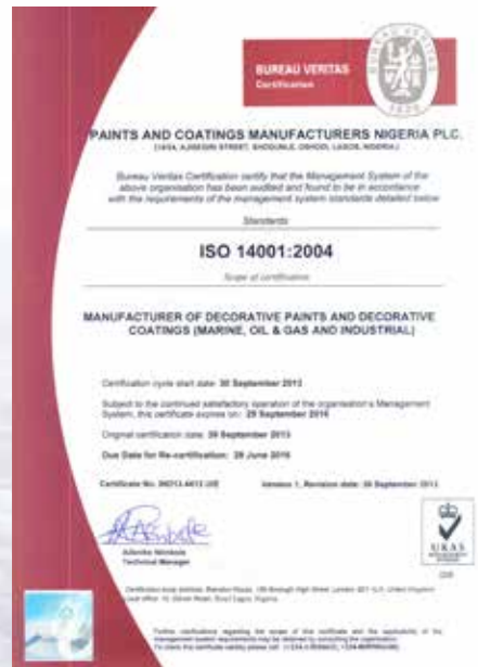
World Class OHSAS