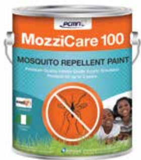
MozziCare 100: Premium mosquito-repellent interior grade acrylic emulsion, available in smooth satin and silk finish